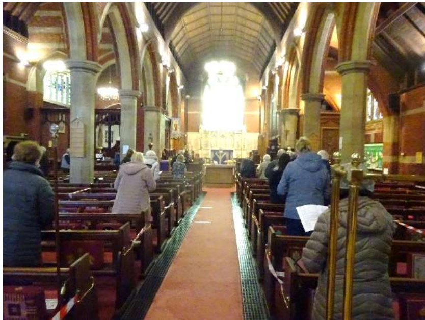
Service during Lockdown 2021

There are normally three services on a Sunday namely 8am Holy Communion (CW2), 10.30am Parish Eucharist (CW1) and 6.30pm BCP Evensong (wks 1/3) otherwise Evening Prayer with Benediction of the Blessed Sacrament in week three. Children's Church is held on two Sundays in the month with activities, songs and stories for younger children.