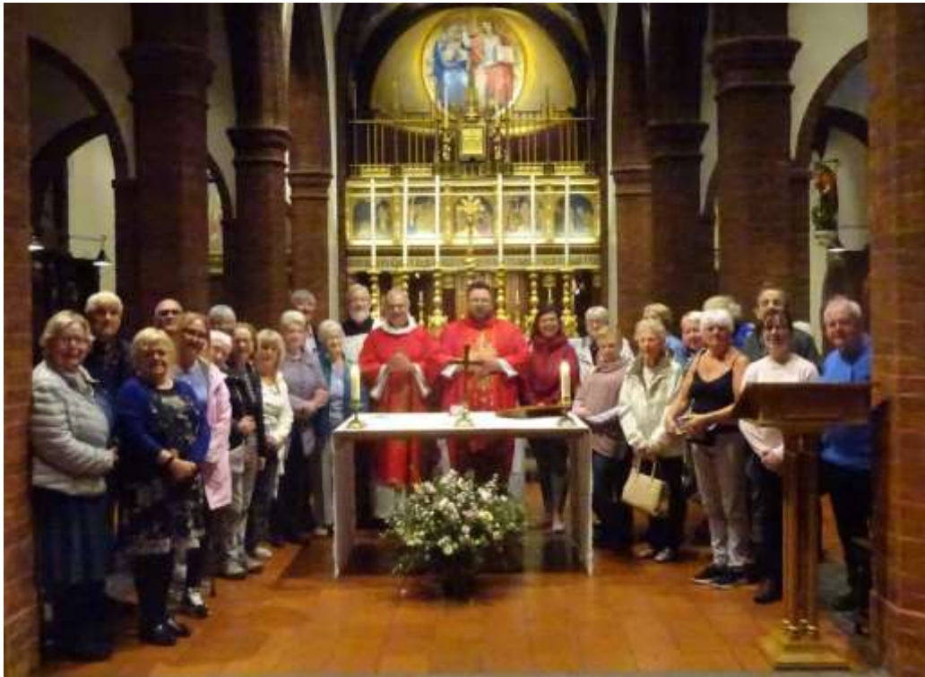
Walsingham Shrine Church 2019

Our annual pilgrimage to Walsingham normally takes place in September (cancelled in 2020) with between 25 and 35 pilgrims. This includes friends from across the Fylde and further afield, but the pilgrimage is organised and led by St Annes.