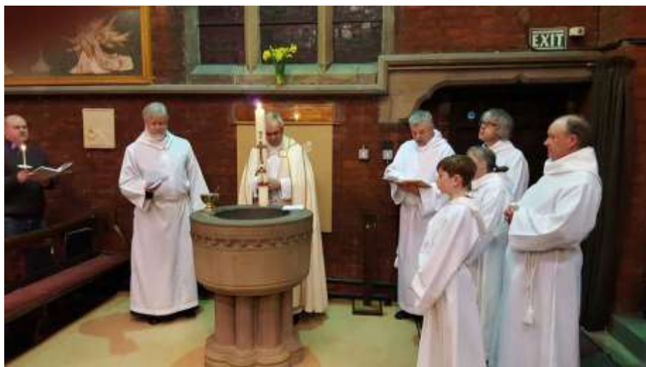
St Annes, Easter Eve 2016

As with most churches Christmas and Easter are high spots of the year. Christmas is celebrated with a popular Carol Service, a packed-out Crib Service on Christmas Eve and traditional Midnight Mass and Christmas Morning Eucharists. Including the Crib Service there were 196 communicants in 2019. The Easter Triduum is fully celebrated with traditional Maundy Thursday and Watch, Good Friday Liturgy, Easter Eve, and Easter Morning. Unusually, our Good Friday Liturgy is held at 6pm and this usually gets around 50 attending. Easter communicants in 2019 numbered 190 with total attendance of 280.